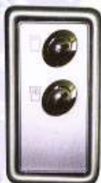
AM2000 Control Panel